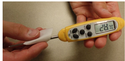
Cleaning a food thermometer with an alcohol wipe