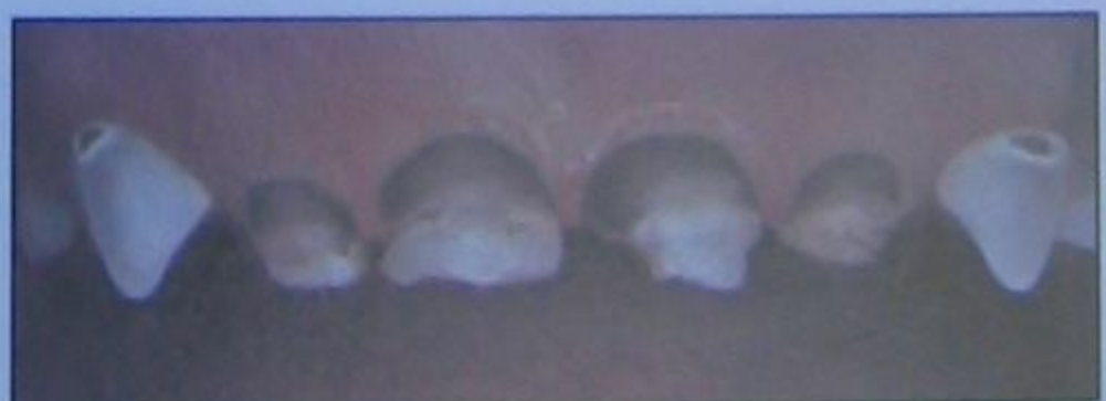
STAGE 4 Severe Decay. Must see a dentist to avoid future tooth damage