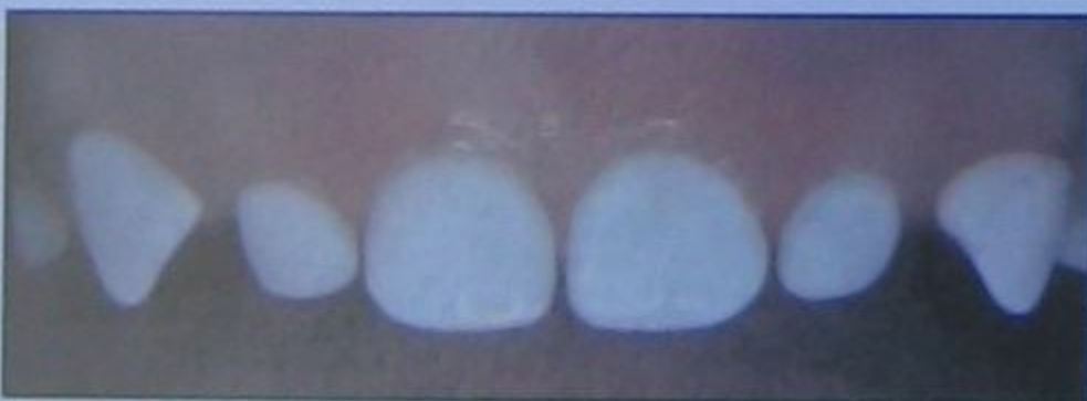
STAGE 1 Healthy Teeth