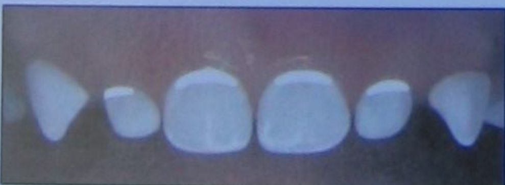
STAGE 2 Whitish lines along the gum line could mean the beginning of tooth decay