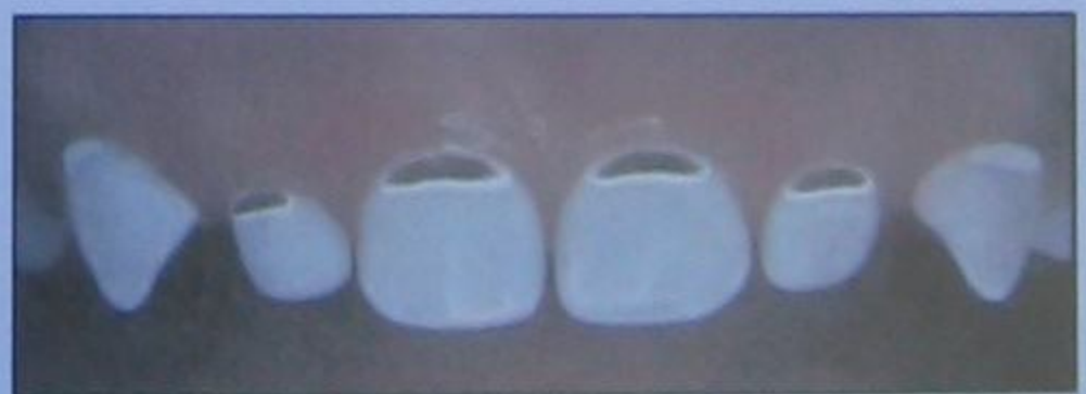
STAGE 3 Brown areas or decayed spots along gum line.